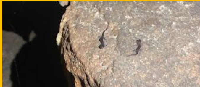
Yin and Yang Salamander Babies