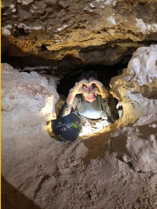
Squilliam being cute